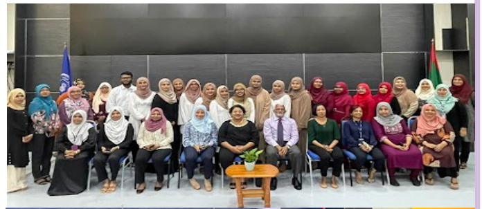
سینئر ایگزیکٹو ڈائریکٹر کے ساتھ گھوڑے کے ساتھ گھوڑے کے ساتھ