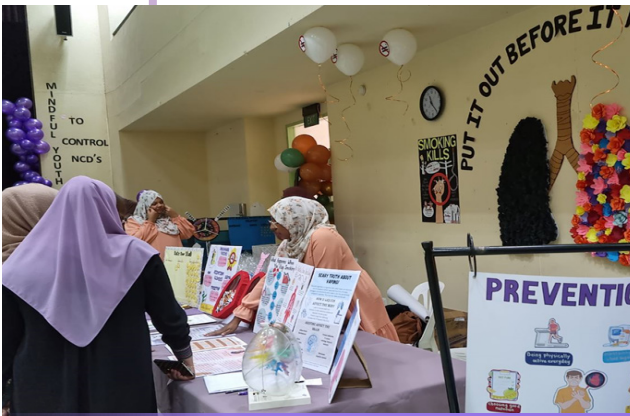
ސަލާމަތު ޖެހިގެން ދިވެހިރާއްޖެ (ސަރަޙައްދު 8) ގެ ތަވަސްތަކުގެ ތެރެއިން ދިވެހިރާއްޖެ