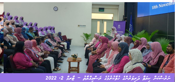
سینئر ایگزیکٹو ڈائریکٹر کے ساتھ گھوڑے کے ساتھ گھوڑے کے ساتھ - 2، 2022