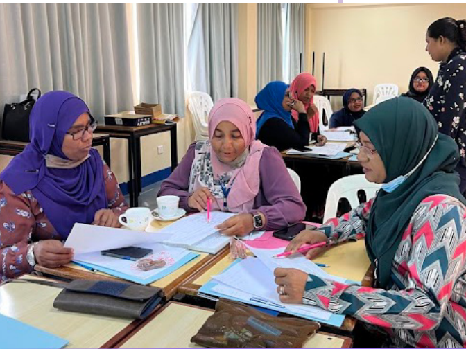
سینئر ایگزیکٹو ڈائریکٹر کے ساتھ گھوڑے کے ساتھ گھوڑے کے ساتھ