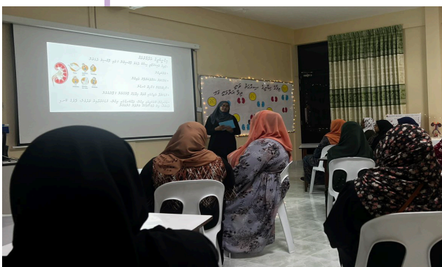
ސަލާމަތު ޖެހިގެން ދިވެހިރާއްޖެ (ސަރަޙައްދު 8) ގެ ތަވަސްތަކުގެ ތެރެއިން ދިވެހިރާއްޖެ - ތަވަސްތަކުގެ ތެރެއިން