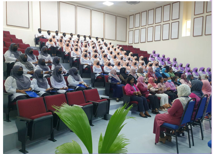
سینئر ایگزیکٹو ڈائریکٹر کے ساتھ گھوڑے کے ساتھ گھوڑے کے ساتھ - 2، 2022