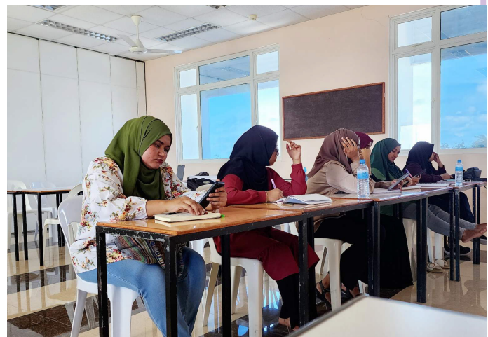
سینئر ایگزیکٹو ڈائریکٹر کے ساتھ گھوڑے کے ساتھ گھوڑے کے ساتھ