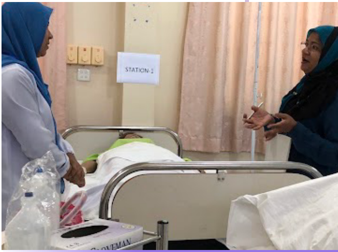
رنگیناؤس گھوڑے - سائنس دانوں کے ساتھ