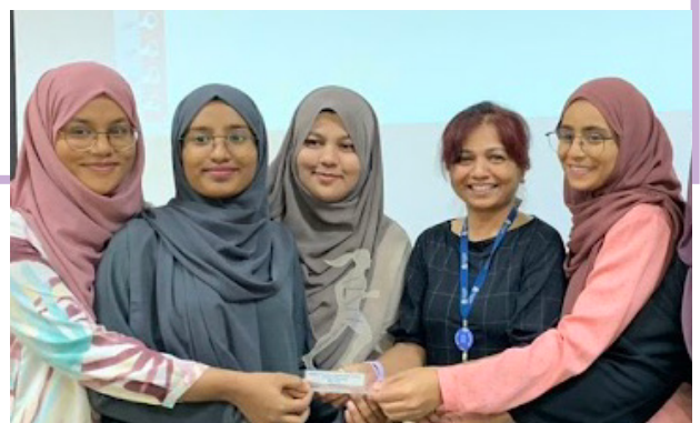
ސަލާމަތު ޖެހިގެން ދިވެހިރާއްޖެ (ސަރަޙައްދު 8) ގެ ތަވަސްތަކުގެ ތެރެއިން ދިވެހިރާއްޖެ