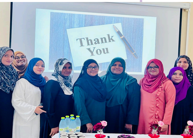
سینئر ایگزیکٹو ڈائریکٹر کے ساتھ گھوڑے کے ساتھ گھوڑے کے ساتھ