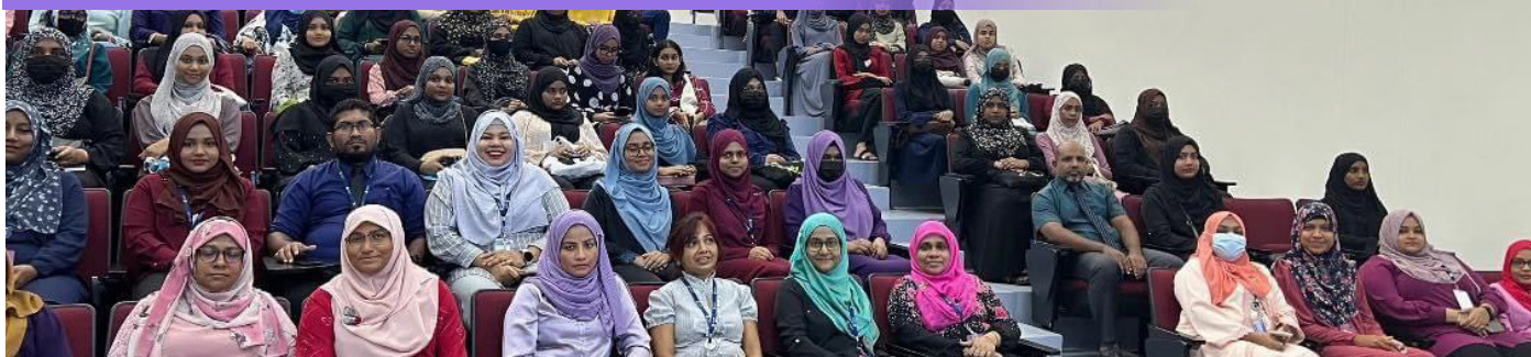
Orientation Term 2 2022 at SN Auditorium

The Term2 Orientation for students of School of Nursing (SN) was held from 16th-31st August 2022. It was organized and conducted in a unique way to help students get oriented, inspired and also enjoy their student life at SN.