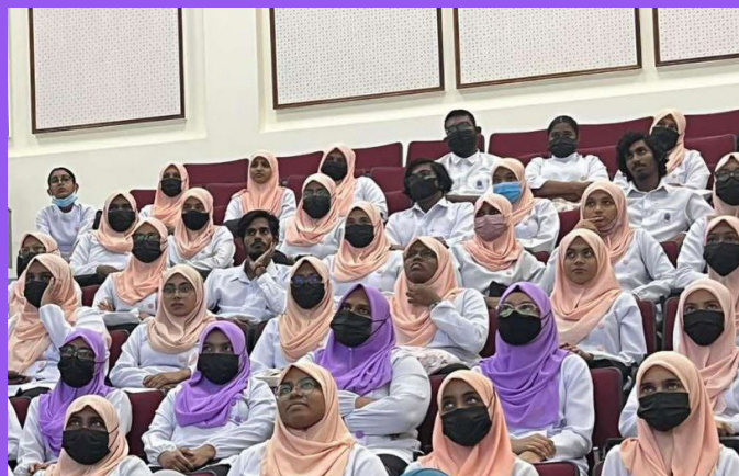
Clinical Orientation at School of Nursing Auditorium