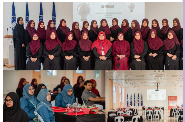
ދިވެހިރާއްޖެ ދިވެހިރާއްޖެ ތަވަސްތަކުގެ ތެރެއިން (ސަރަޙައްދު 5) ގެ ތަވަސްތަކުގެ ތެރެއިން