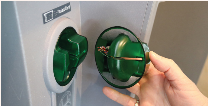
Attaching a counterfeit reader in an ATM

One of the most common way criminals use to steal money from ATM is by skimming. In skimming a counterfeit reader is fitted into the ATM machine that reads and stores all the information on the magnetic strip on the card. This information is given to the hacker and the hacker will use this information to steal money from the victims account.