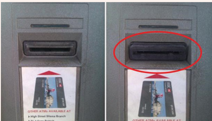
A skimmer inserted into an ATM machine

The most frequently used method of skimming is by placing a reader in the inside reader of the card. Before inserting a card into an ATM machine check the PIN keyboard and card insert slot. When a skimmer is inserted into the ATM the machine will look slightly different.