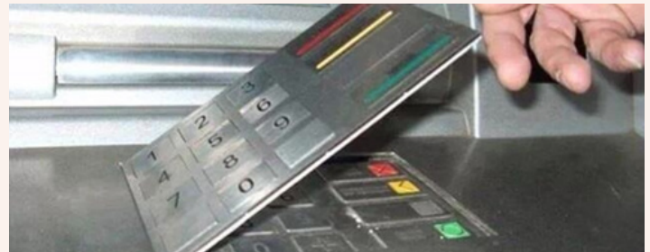
.A false keyboard attached to an ATM

Skimming is not the only way criminals steal money from your ATM cards. Fake keypads is another tool used to record PIN inputs. Criminals install fake keypad over on the actual keypad to steal the PIN number. Capturing people's PINs through a false keypad is known as a 'pin-pad overlay'. Several cases of pin-pad overlay has been reported in the world.