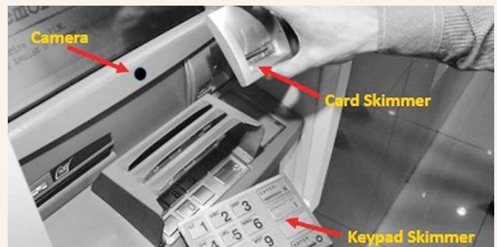
Hidden camera attached to an ATM

The most common way criminals use to steal money from ATM is by using a hidden camera near the ATM machines. These cameras are strategically fitted in a way that can capture the PIN information. These cameras are small and will be fitted near the keypad. These cameras are hard to identify.